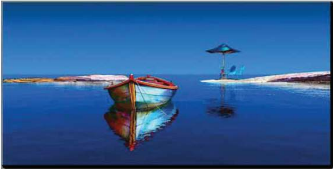
40 Years Together