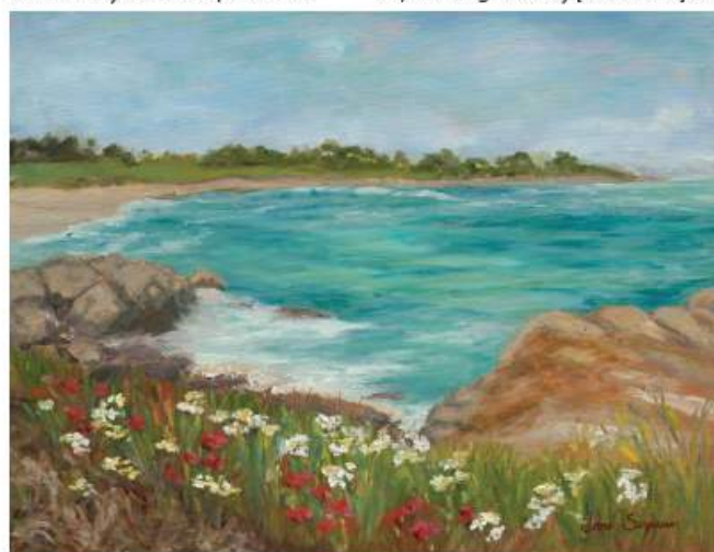
Pacific Grove by Jane Seymour 2019

"Different styles, impressionistic styles, the collectability of [different artists], there's a lot of different things