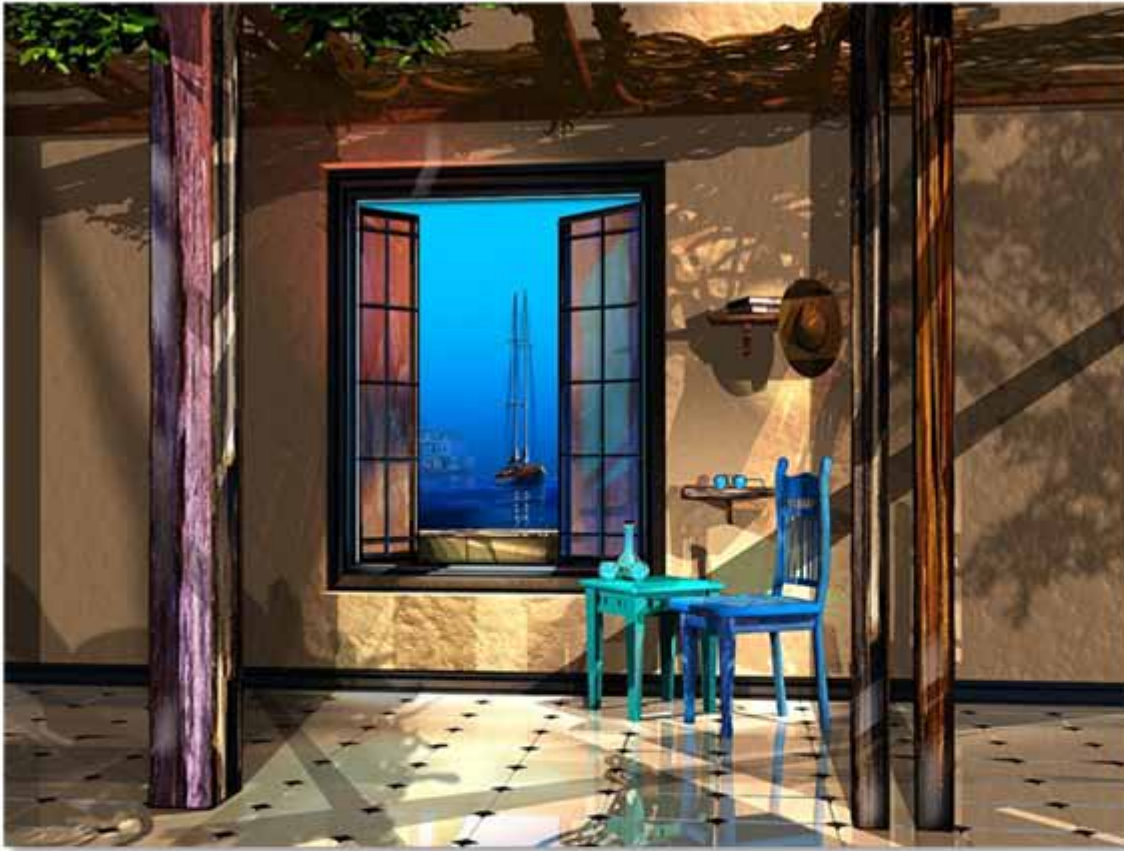
Good to be Home

In addition to an extraordinary collection of artwork and custom-framing, Ocean Galleries also offers a variety of hand-made crafts from local, regional, and national artists in America, such as glass, pottery, jewelry, and furniture. All summer exhibitions take place at the Stone Harbor location of Ocean Galleries (9618 Third Avenue). Ocean Galleries also has an Avalon, NJ location at 2199 Ocean Drive. For seasonal hours at both gallery locations, call 609-368-7777 or visit ocean-galleries.com