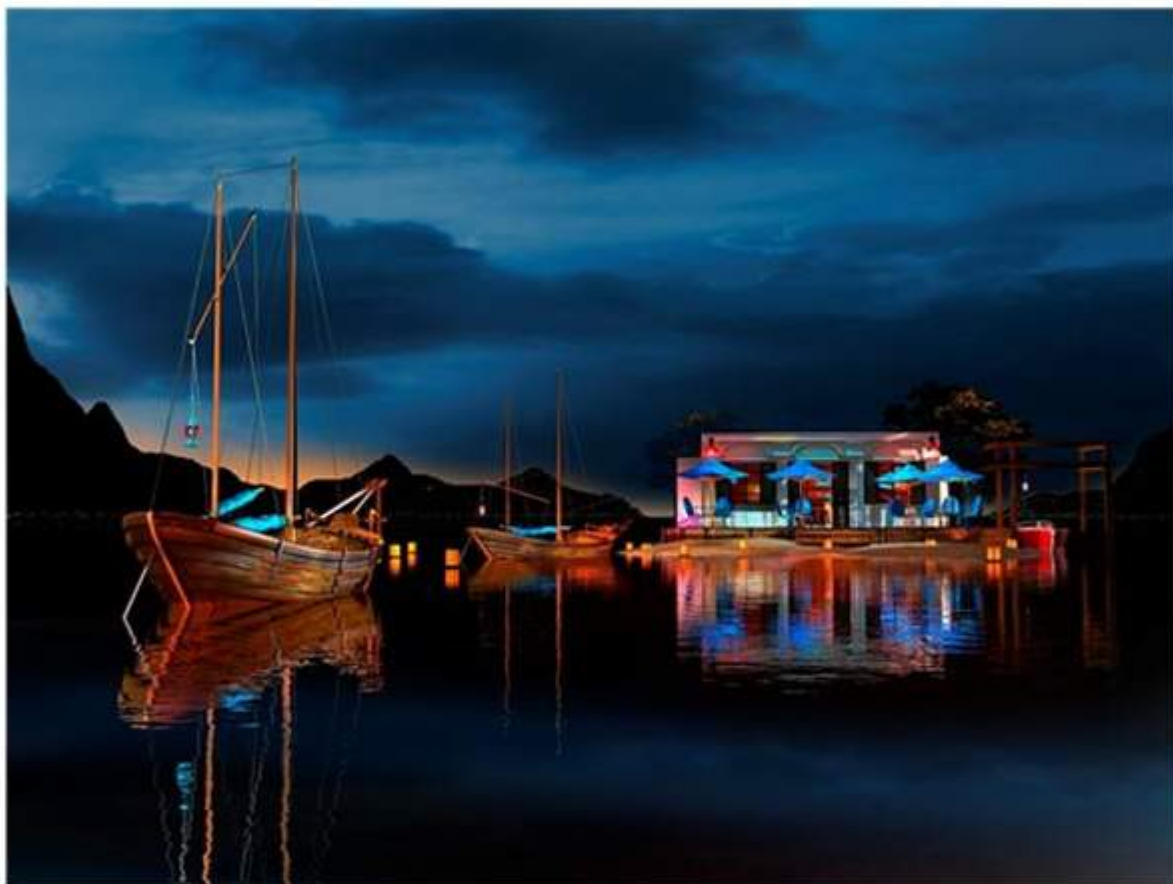
Heard About This Place