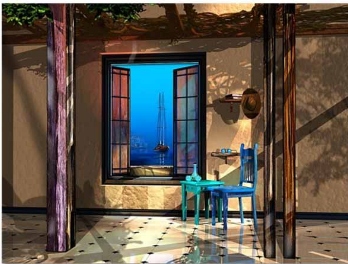
Good to be Home, Copyright Stephen Harlan

The free exhibition is open daily from 10:00am until 10:00pm throughout the weekend, with all artwork in the collection available for acquisition.