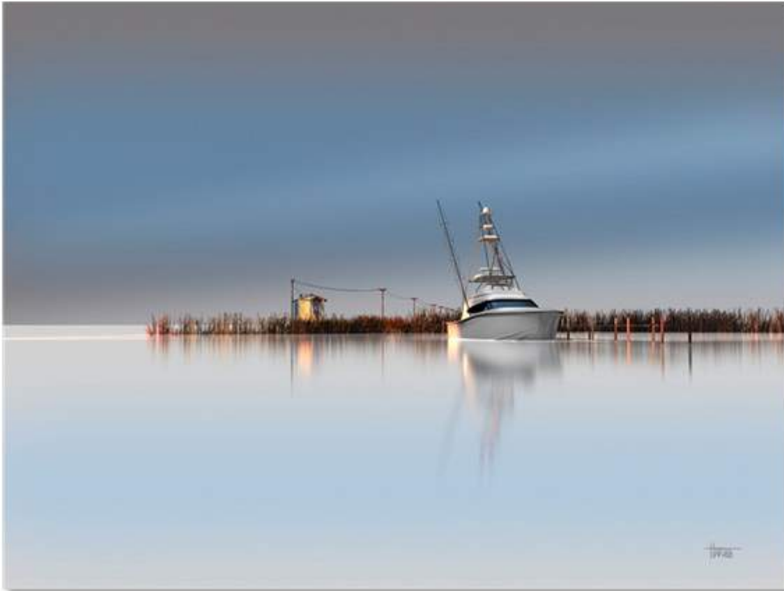
Not a Sound