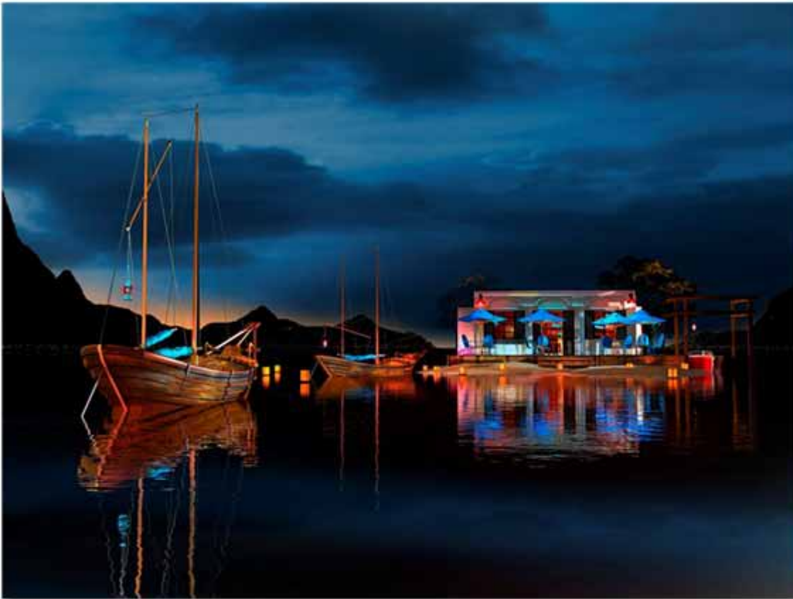
Heard About This Place