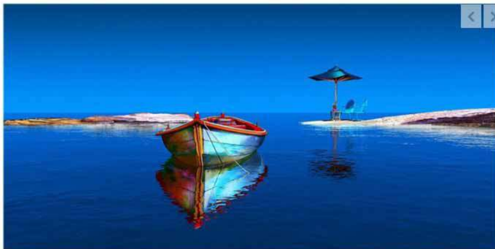
"40 Years Together,"