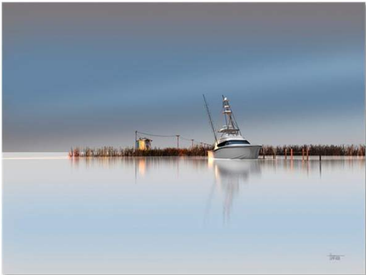
Not a Sound